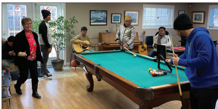
EM KEA early morning respite