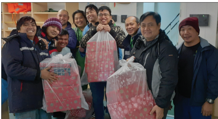
Norse Ijmuiden crew expressed immense joy as they opened gifts.