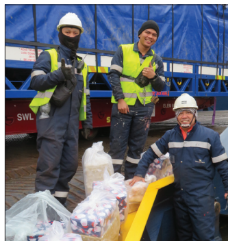
Atlantic Sun Crew