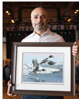
Winner of Frames Plus Art print