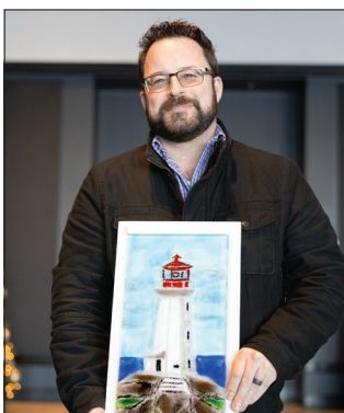
Winner of stained-glass lighthouse