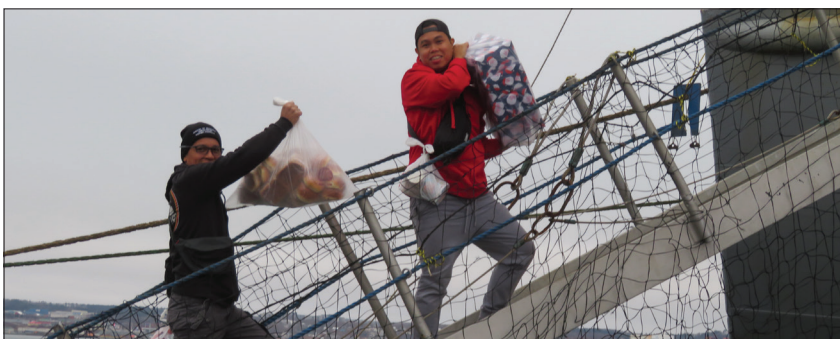
MV Fortaleza crew happy with Cobs bread and gifts