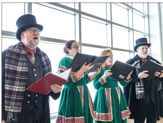
East Coast Carollers