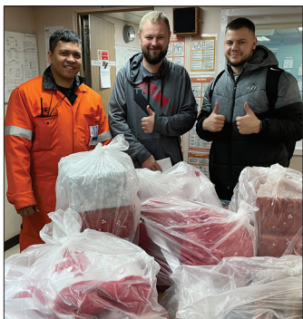
MV MELINA Crew delighted

to mention a few, this initiative would not soar as wonderfully as it does. This year you helped to distribute 1228 gifts of love. Please be aware of the difference your generosity makes to a seafarer, whose only gift at Christmas is most likely YOURS! We have MtS watchkeepers and special friends who offer their time to build and wrap shoebox gifts. Enjoy the snippets below of hope and joy, as our mission chapel turned into an assembly hall of love to be shared.