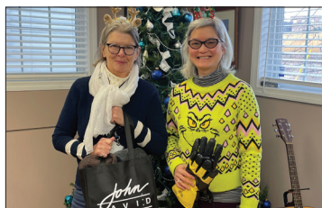
Jeanne & Jenny Maritim Museum