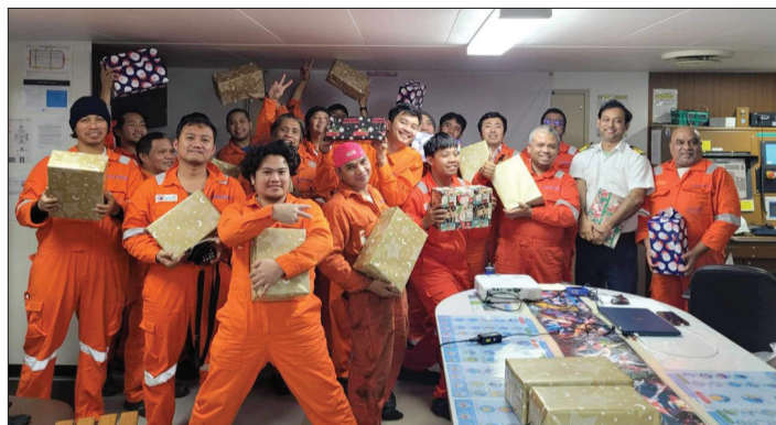
One Cygnus sends message of thanks