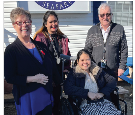
Excited about Peggy's Cove

I've had four surgeries and stayed at the hospital for one month and four days. Every week is a different kind of pain. That's where I experienced my highs and lows. And I really thank God that I have survived it. I'm just telling myself that HE must have something in store for me, so He let this happen. That he let this acci-