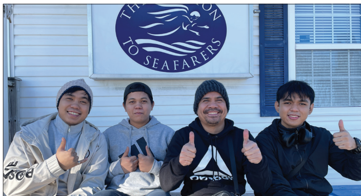
MSC Nerissa crew enjoy shore leave