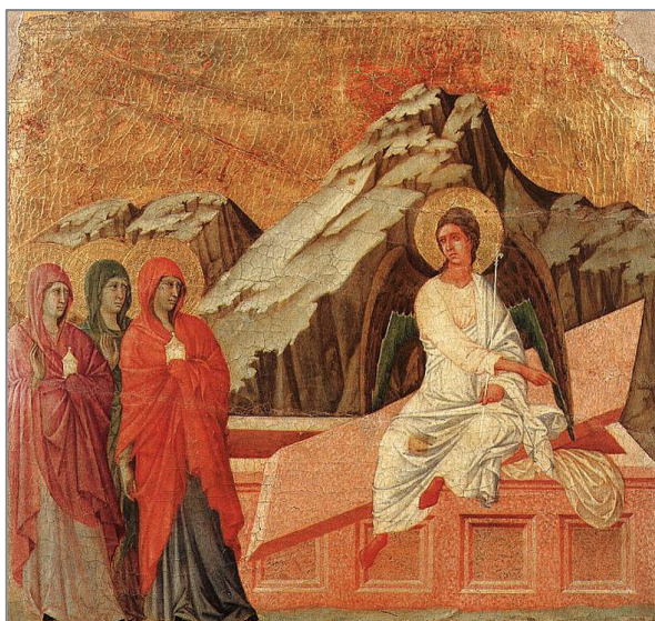
The Three Women at the tomb, Duccio di Buoninsegna, 1308-11, Tempera on wood.

April 3, at 11:00 pm we come together for the great Vigil and First Mass of Easter. We begin in darkness and end in the Divine Light. We enter the Mystery.